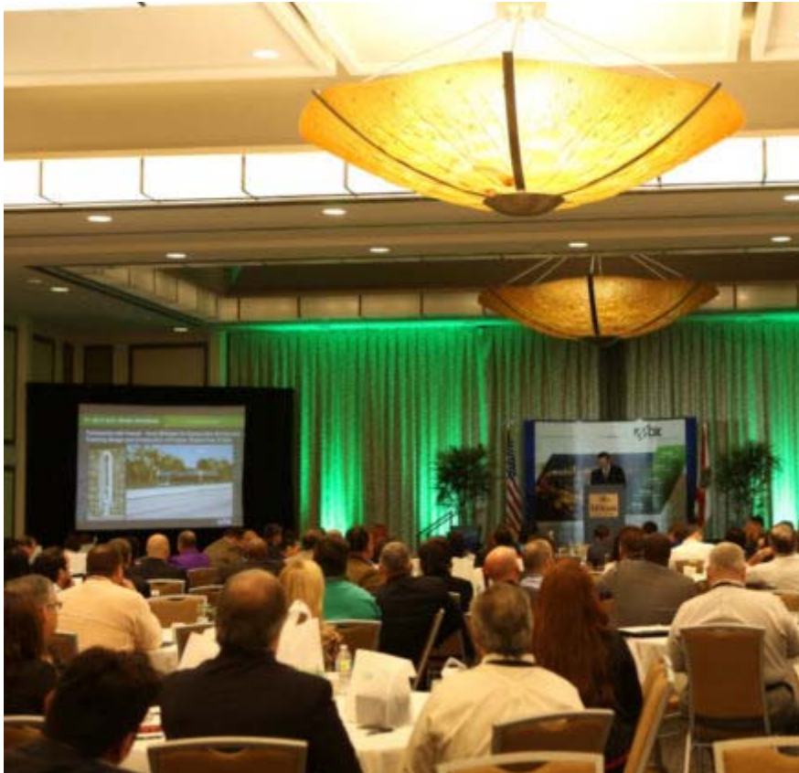
More than 260 people attended this year's MDX for Business Conference.