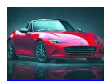
Drop the top for ...