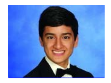
Student Spotlight ...